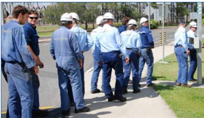
Station employees check in at Evacuation Point 1

On Friday 19 December the site wide evacuation alarm was activated at the station with everyone stepping out briskly to participate in a planned drill.